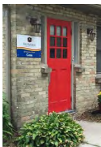
Capital Improvements $200/Month