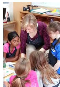
Faculty Development $50/Month