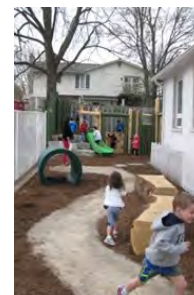
Special Projects $75/Month