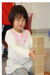
Program Materials $25/Month