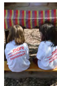
Leadership Circle $500/Month

To find out about the 50 th Anniversary Celebrations happening Friday & Saturday, June 1 & 2, 2018, sign up to receive email updates on our Google site: