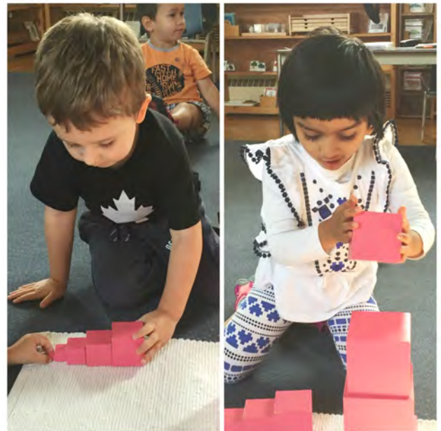
Casa children using and example of Montessori's self-correcting material—the famous Pink Tower.

In Casa, students begin to own the flow of their day, making independent choices of what work they would like to do and complete it. Many of the materials at this level are self-correcting, so it is through their own discovery, when an error has been made, that they need to problem solve and try it again...all without an adult intervening. The mantra "help me to do it myself" guides the interactions of the teachers