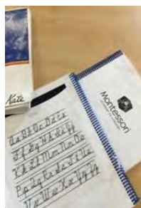
Tuition Support $100/Month