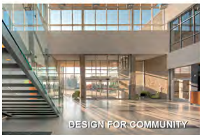
DESIGN FOR COMMUNITY