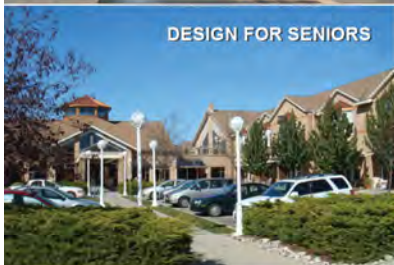
DESIGN FOR SENIORS