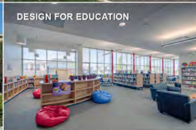
DESIGN FOR EDUCATION

CORNERSTONE ARCHITECTURE INCORPORATED is a service orientated practice with expertise in institutional, educational, administrative, and assembly projects for both public and private clients across Southwestern Ontario.