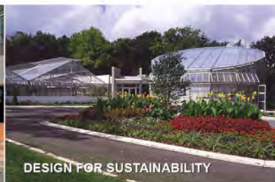
DESIGN FOR SUSTAINABILITY