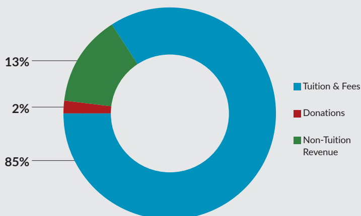
FY2019 GROSS REVENUES: $5,707,884